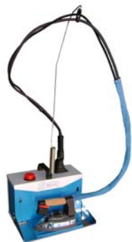
Mod. 1F43 + electric iron