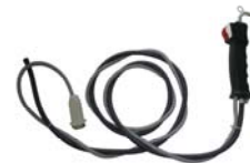
Mod. steam gun